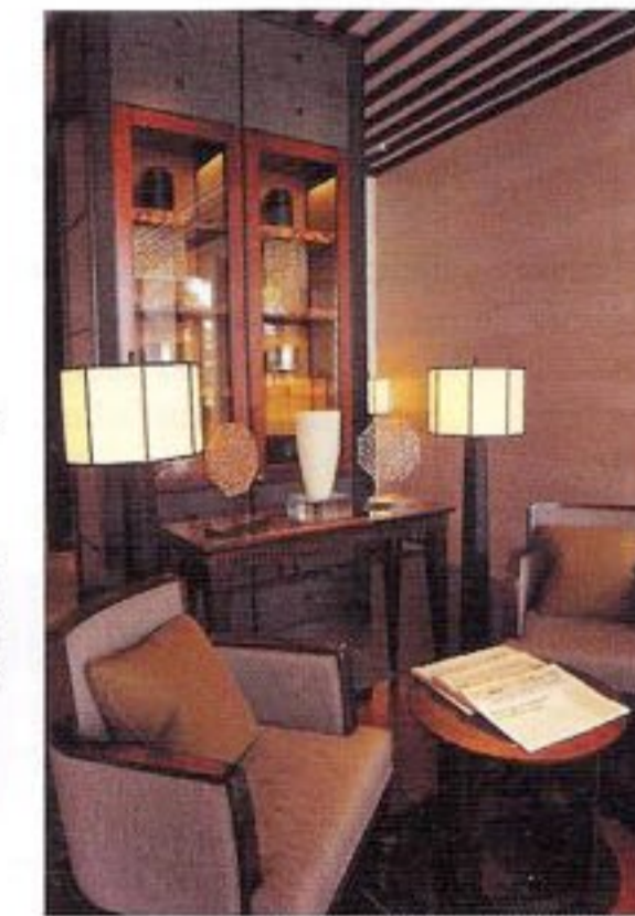
MAKING WAVES The contemporary interior of the Capella Sentosa